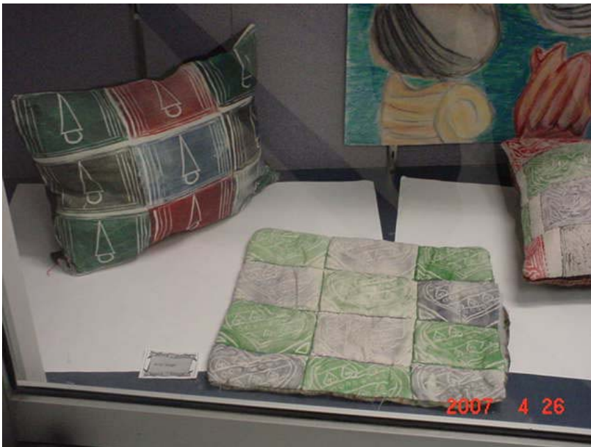
Some students work